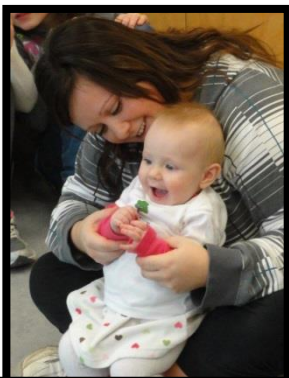
Roots of Empathy