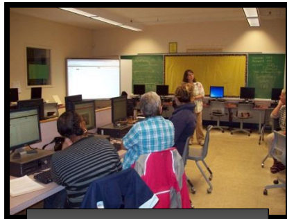
Adult Computer Classes