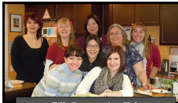
ESL Conversation Club

The Community Literacy Advisory Committees within the district, Castlegar & Area and Greater Trail Area, met both individually and collaboratively on the following dates to examine progress on the 2012-13 plan and to update the plan for 2013-14: September 26 th , 2012, October 1 st , 2012, December 5 th , 2012, January 16 th , 2013, February 26 th , 2013, April 30 th , 2013, June 7 th , 2013 and June 17 th , 2013.