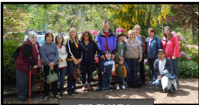
ESL Field Trip

Appendix 2 - The Community Literacy Inventory