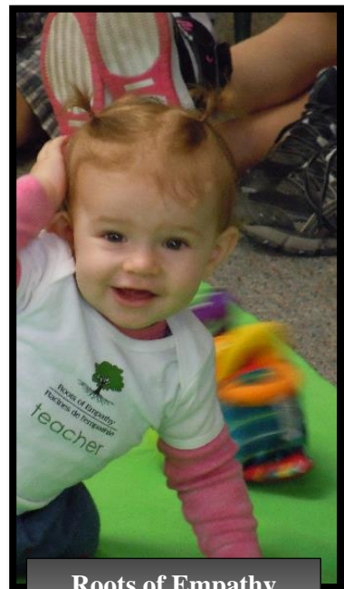
Roots of Empathy