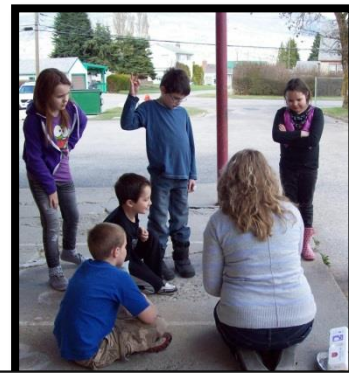
Webster Afterschool Program