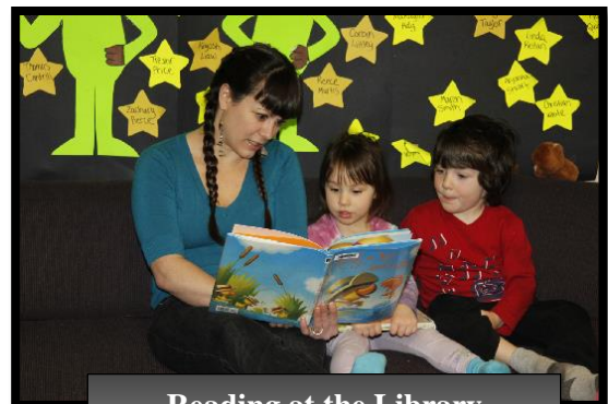
Reading at the Library

At its regular open meeting on June 13, 2013 the Board approved the District-Community Literacy Plan 2013-2014 for submission to the Ministry of Education.