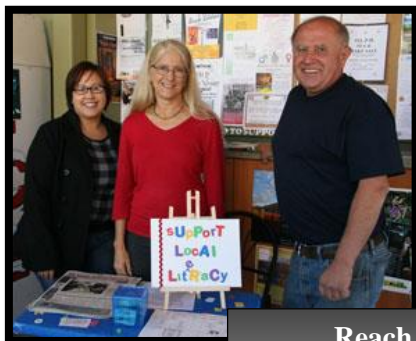
Reach a Reader Greater Trail & Castlegar