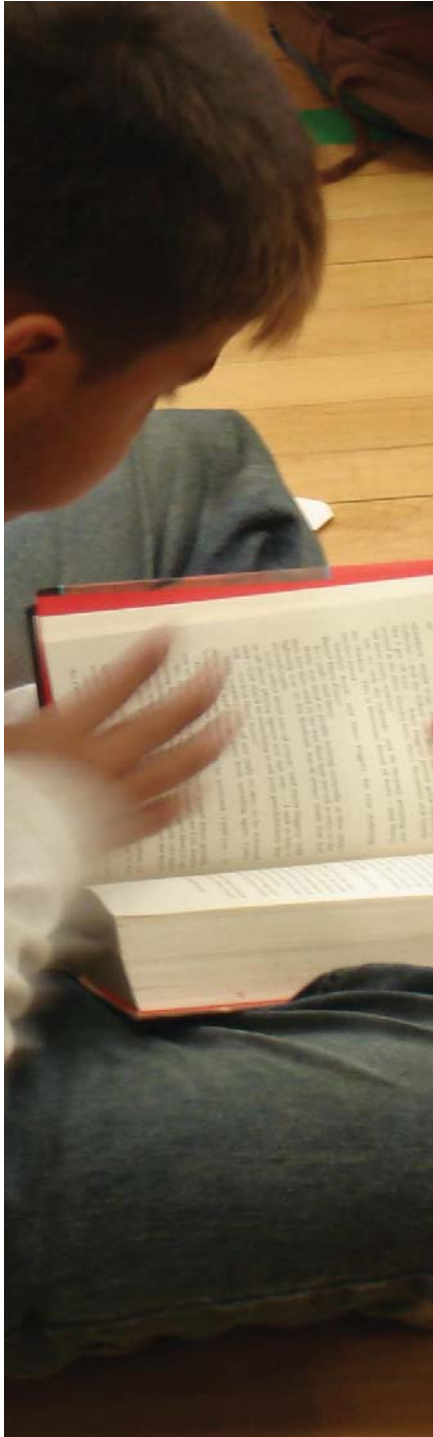
School District 70 (Alberni)