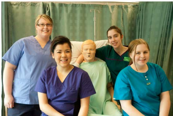
Health Care Assistant