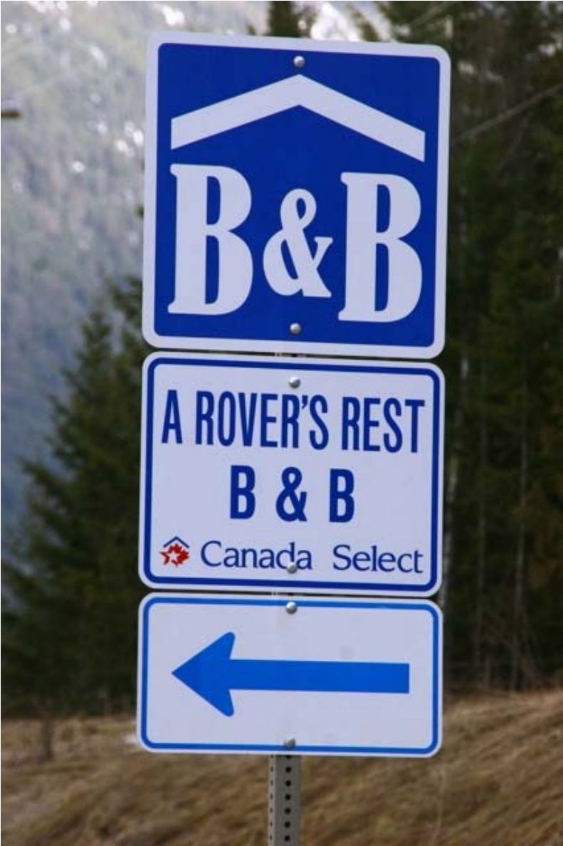
Sample Installation – “Canada Select” Designation on Name Tab