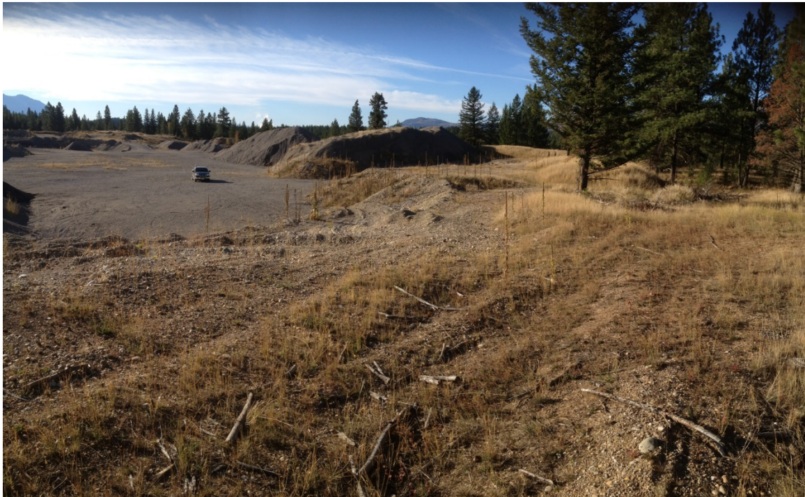
Top of Suitability Area looking South toward crusher setup area